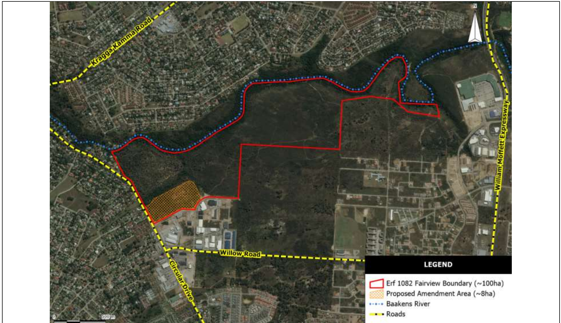
Map 1: Location of Phase 5 and 6 within Erf 1082, Fairview, Nelson Mandela Bay Municipality.