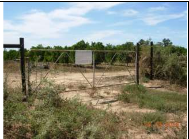
Site Notice Board 2 placed along the pipeline route (33°29'25.84"S; 25°36'16.16"E)