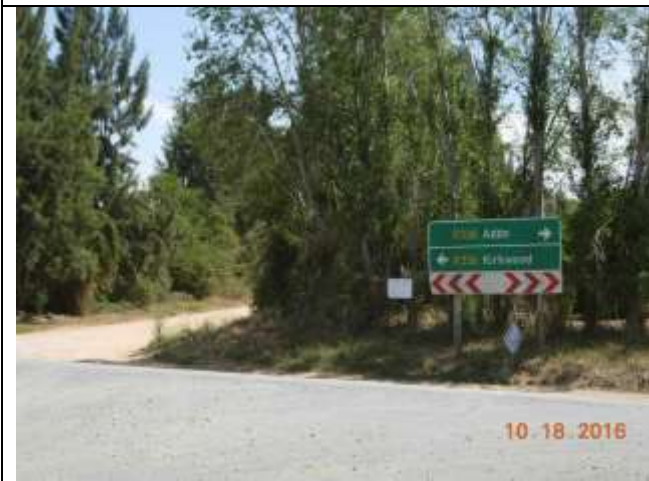
Site Notice Board 3 placed along the pipeline route at the intersection of the R336 (MR00471) and the MR00470 (33°30'9.79"S; 25°36'31.35"E)