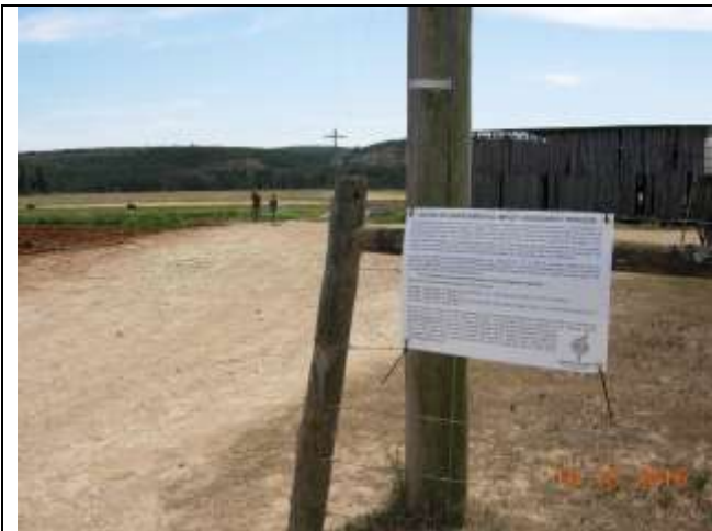
Site Notice Board 1 placed along the pipeline route (33°28'49.27"S; 25°36'5.52"E)