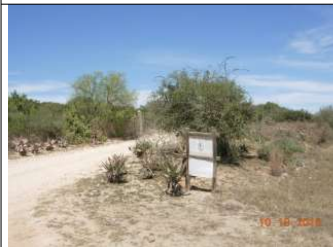
Site Notice Board 5 placed at the entrance to the Remainder of Farm 653 (33°32'9.82"S; 25°34'16.36")