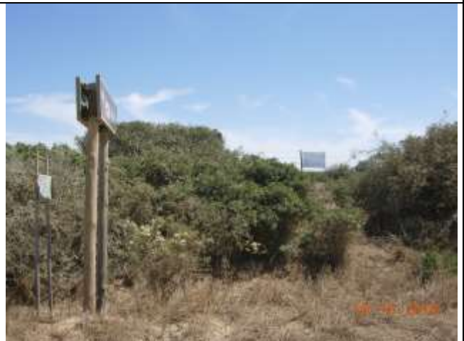
Site Notice Board 4 placed along the pipeline route (33°31'21.47"S; 25°36'1.61"E)