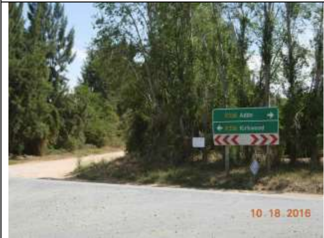
Site Notice Board 3 placed along the pipeline route at the intersection of the R336 (MR00471) and the MR00470 (33°30'9.79"S; 25°36'31.35"E)